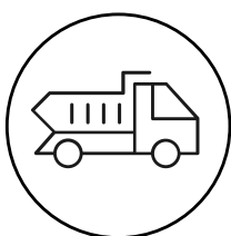
Plant & Machinery